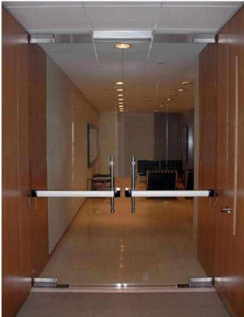
Exhibit 2 depicts an electrically controlled egress door assembly installed across an egress path, as viewed from the side providing egress. The door is held in its locked position by an electromagnet. Entry from the opposite side is gained by a card reader. The door can be opened from the egress side via a lock/latch release, installed on the door leaf, that directly removes power from the electromagnet. The occupant sees the unlocking process as being no different than that performed for a mechanically released latch, but the locking and unlocking mechanisms are electronic.

for special locking arrangements, regardless of how the lock was operated. The text applicable to electrically controlled egress door assemblies has the effect of equating the electrically controlled lock to a traditional, mechanically latched or locked door.