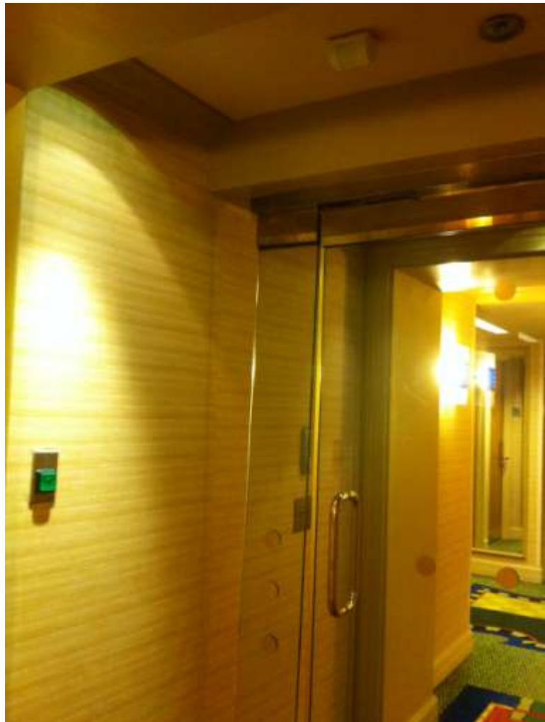
Exhibit 4 Egress side of access -controlled door assembly.

Exhibit 4 shows the same door depicted in Exhibit 3 but from the other side. The door serves as egress for the occupants of the guest rooms in that portion of the corridor. The door is equipped with access-controlled hardware. The motion sensor mounted at the ceiling unlocks the door upon occupant proximity. The PUSH TO EXIT button mounted on the wall serves as a backup should the motion sensor fail.