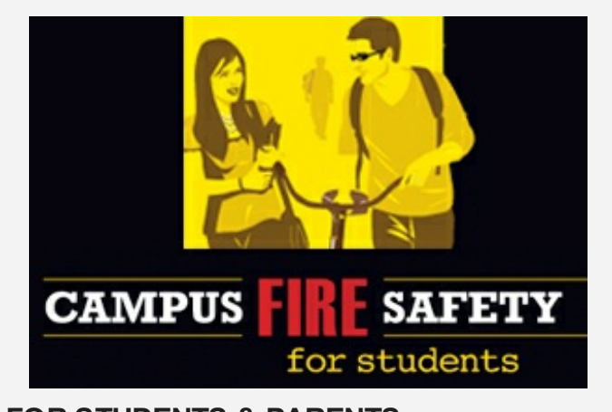
FOR STUDENTS & PARENTS