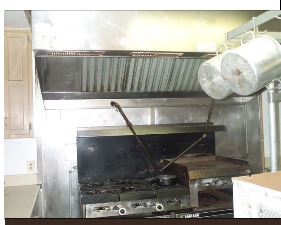
DAMAGED HOOD SYSTEM